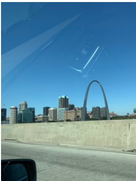
The Arch and Skyline Saint Louis, Mo