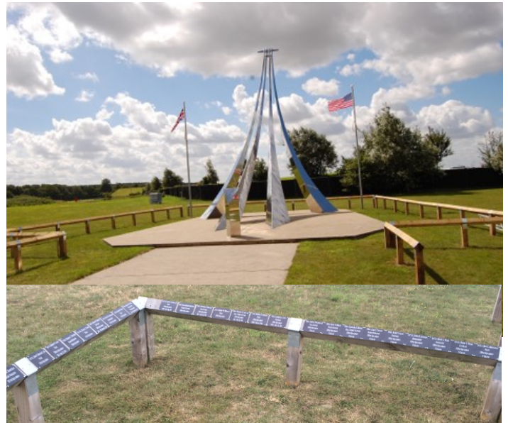
“The Silver Dream”, with a section of the fence and completed plaques in place.