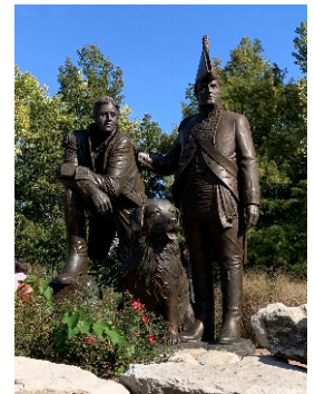
Lewis and Clark Statue Saint Charles, MO