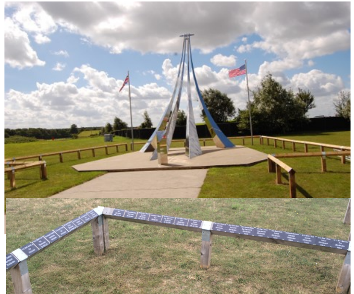
“The Silver Dream”, with a section of the fence and completed plaques in place.

The requests for plaques are still coming in, and we have had one more request for plaques for the whole crew of one B-17. Those are mounted on the fence together in a line. We have received two plaque requests for Ground Crew, and would really like to receive more. So far, since October, we have sent 39 more plaques to be made. Fortunately, with the Virus and businesses being shut down or closed permanently, our plaque supplier has been able to continue with their work.